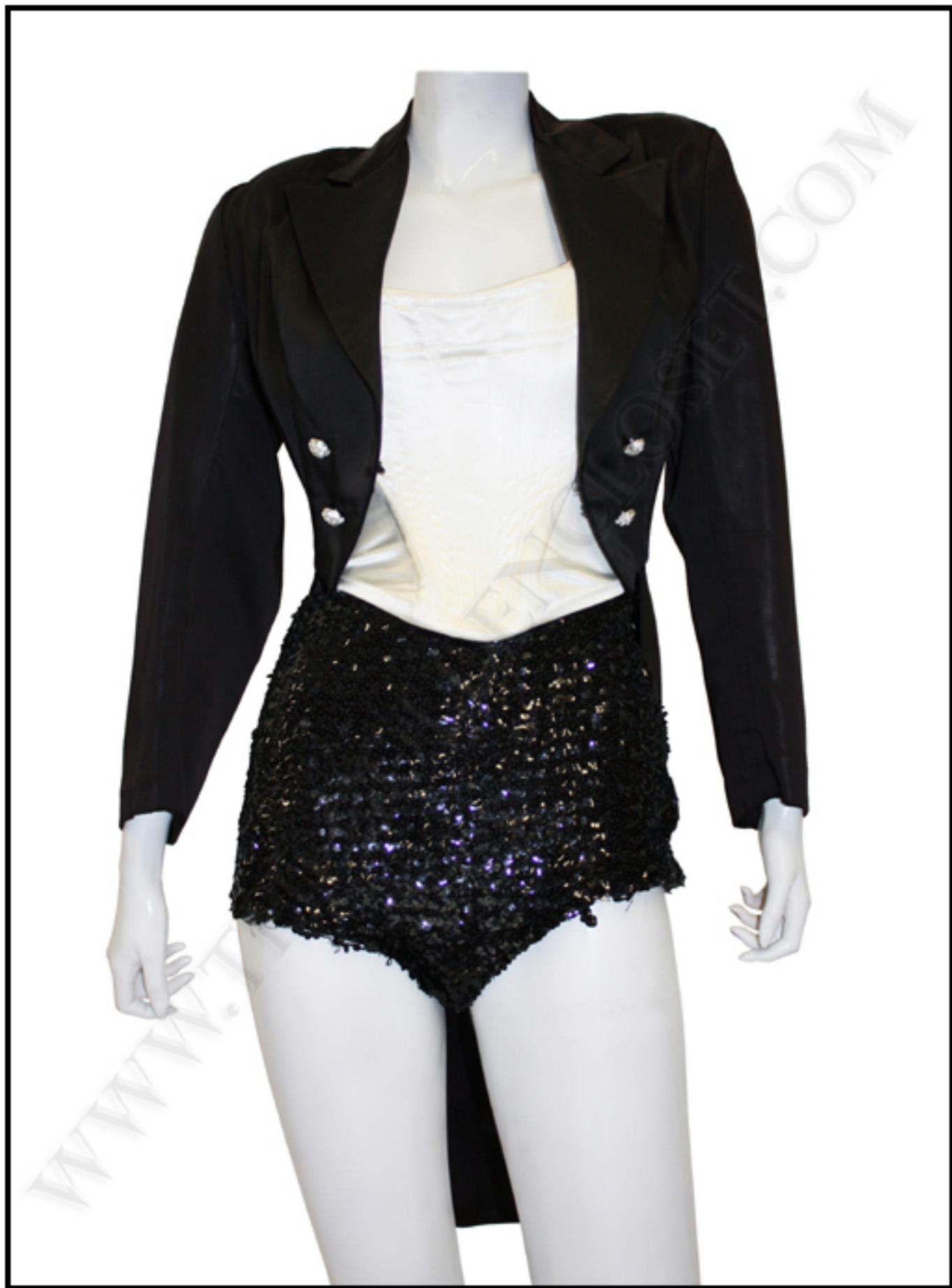
ARTICLE 2: FRONT VIEW