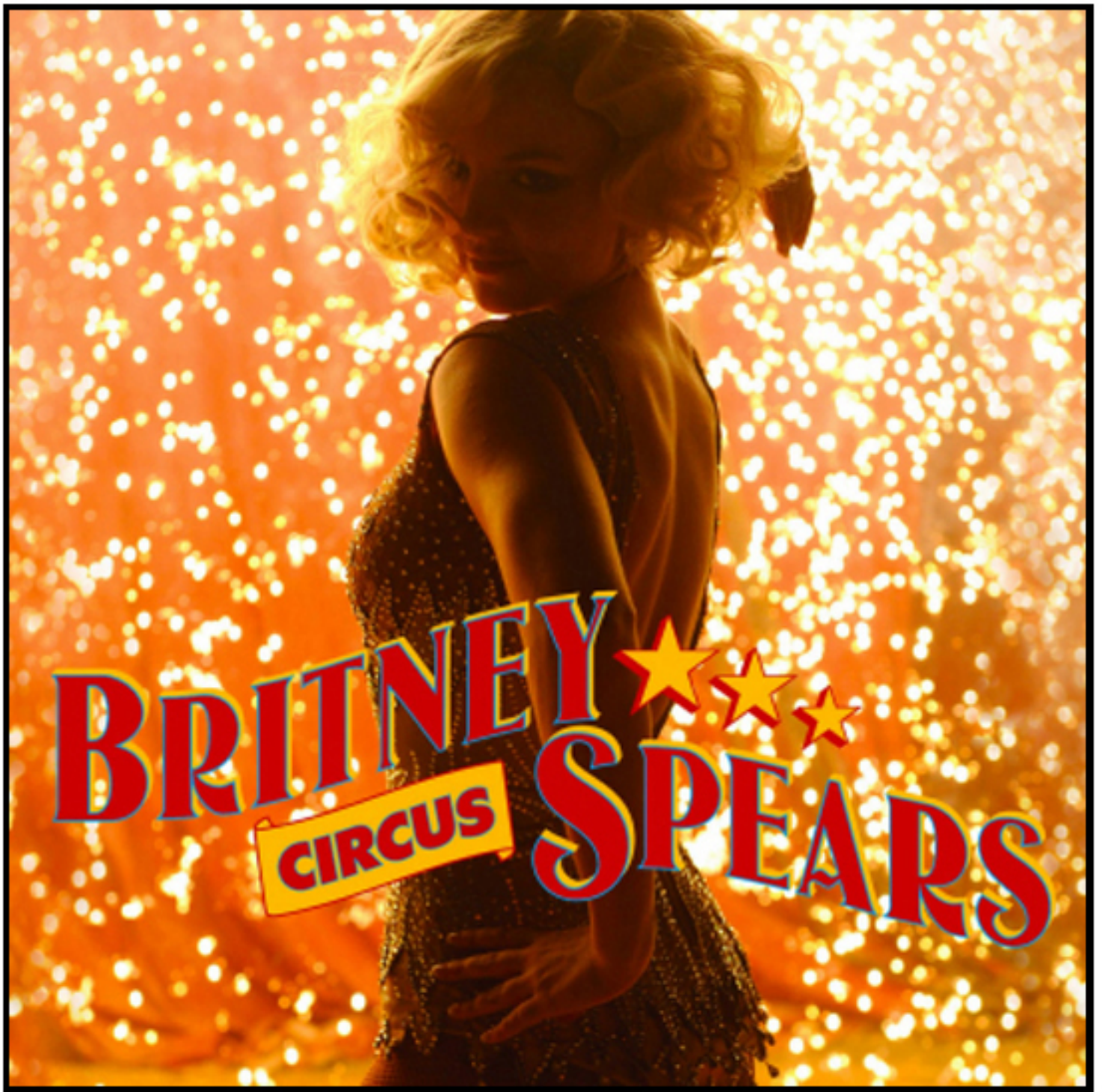
COVER ART FOR THE SINGLE "CIRCUS"