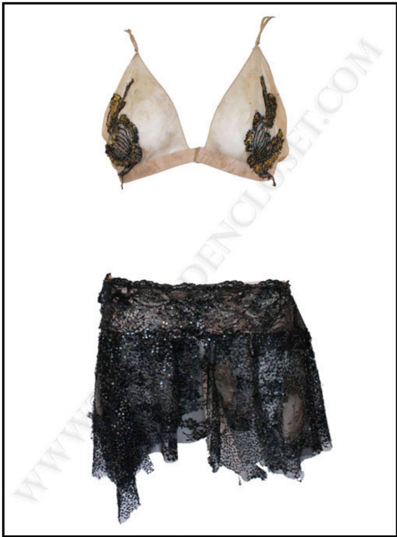
ARTICLE 4: FRONT VIEW