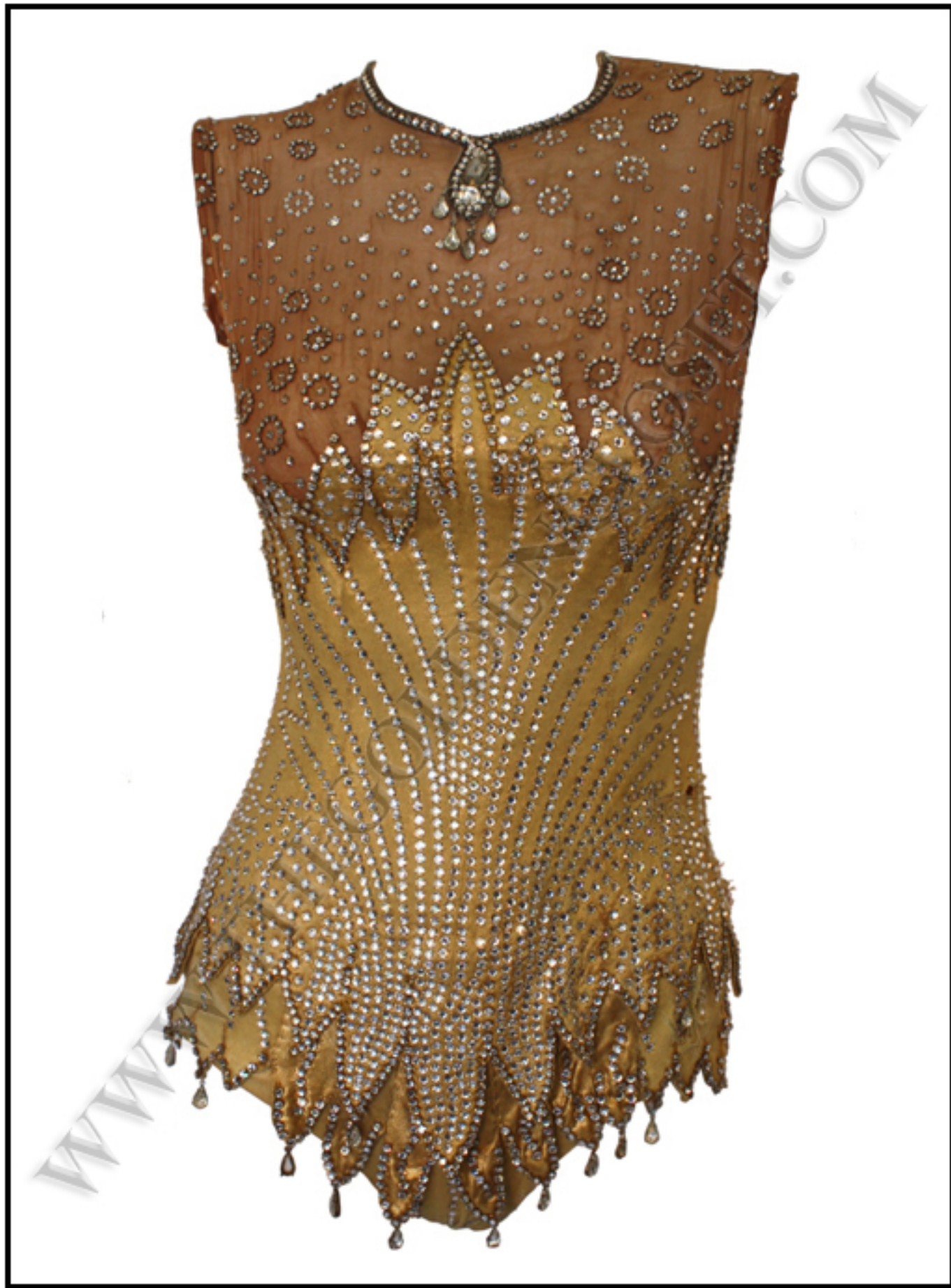
ARTICLE 1: FRONT VIEW