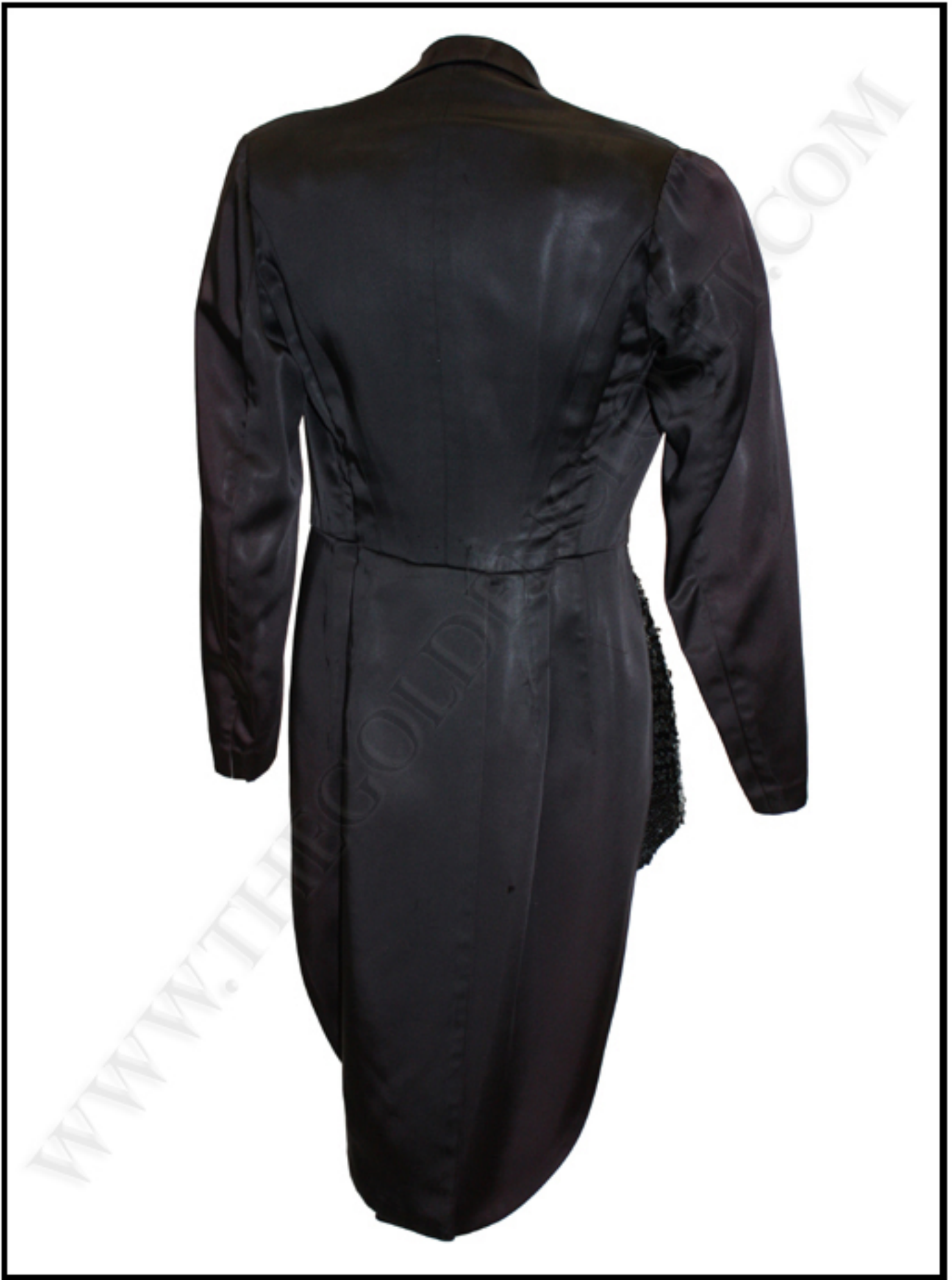
ARTICLE 2: BACK VIEW