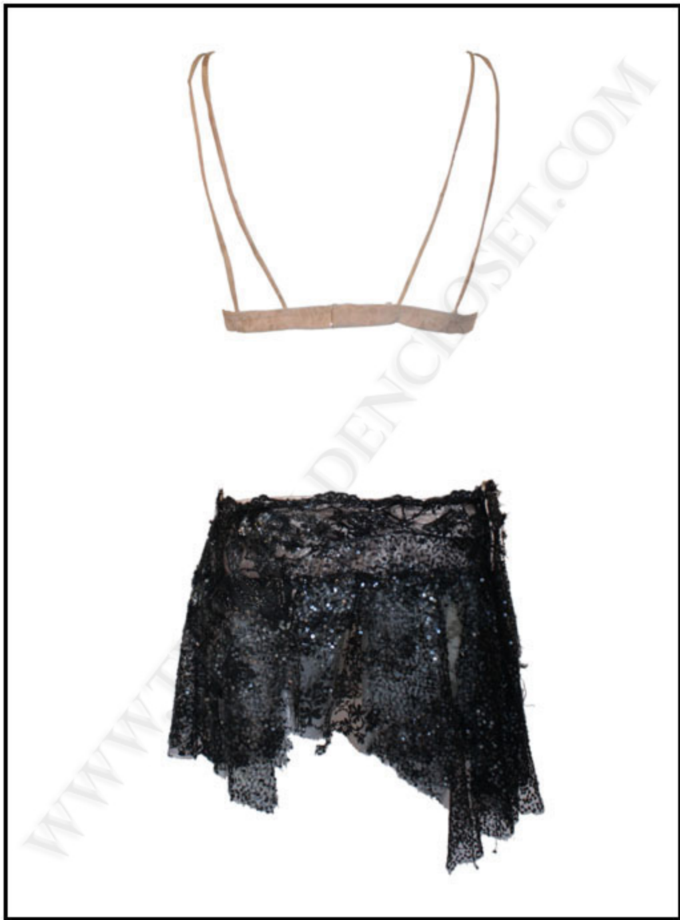
ARTICLE 4: BACK VIEW