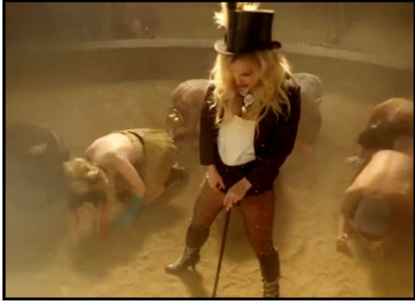
ARTICLE 2: IMAGES FROM THE VIDEO FOR "CIRCUS"