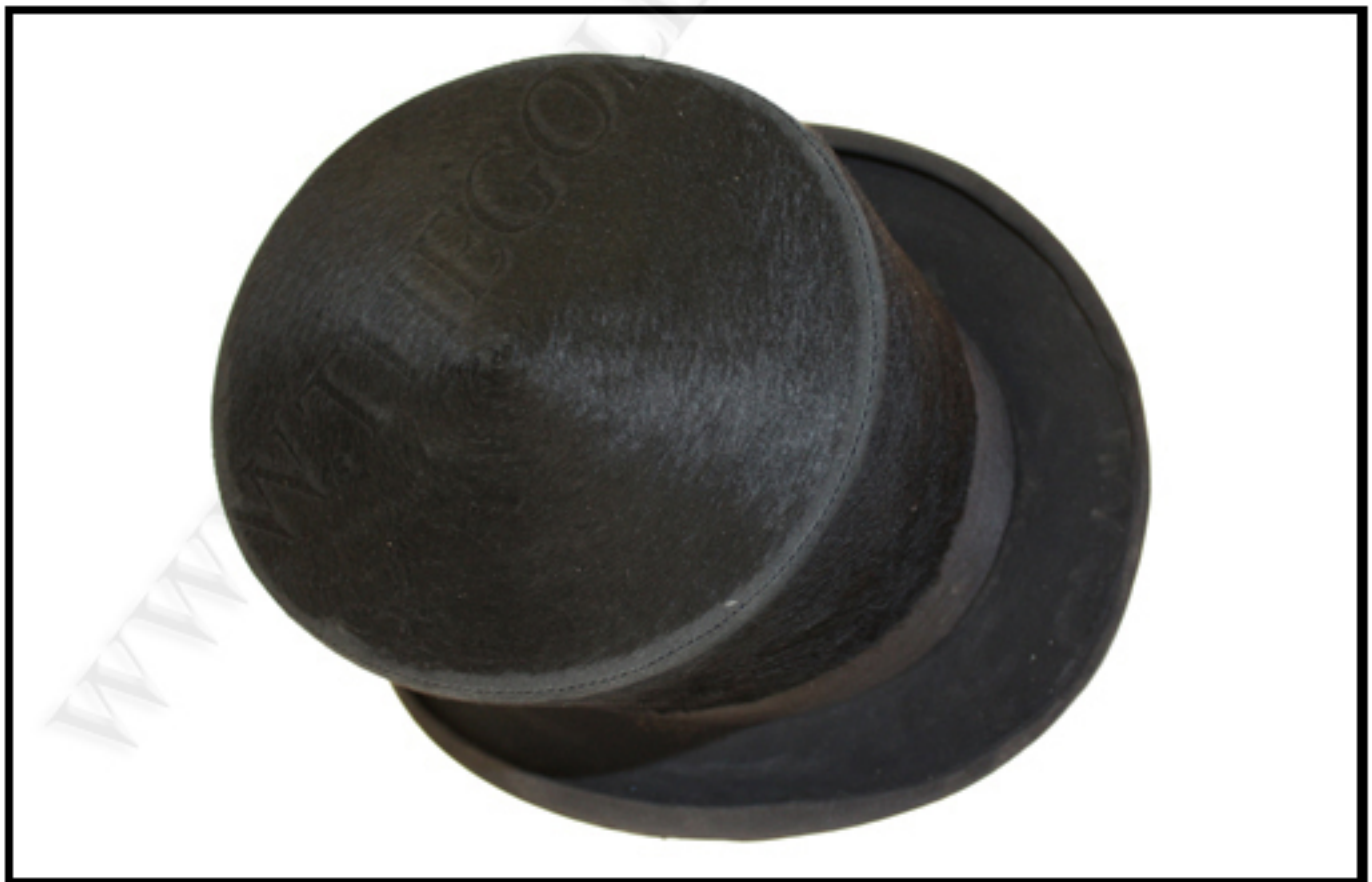
ARTICLE 2: TOP HAT FRONT & TOP VIEWS