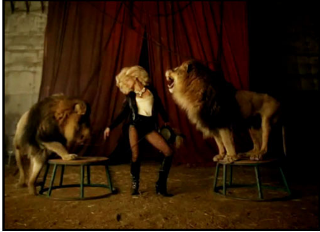
ARTICLE 2: IMAGES FROM THE VIDEO FOR "CIRCUS"