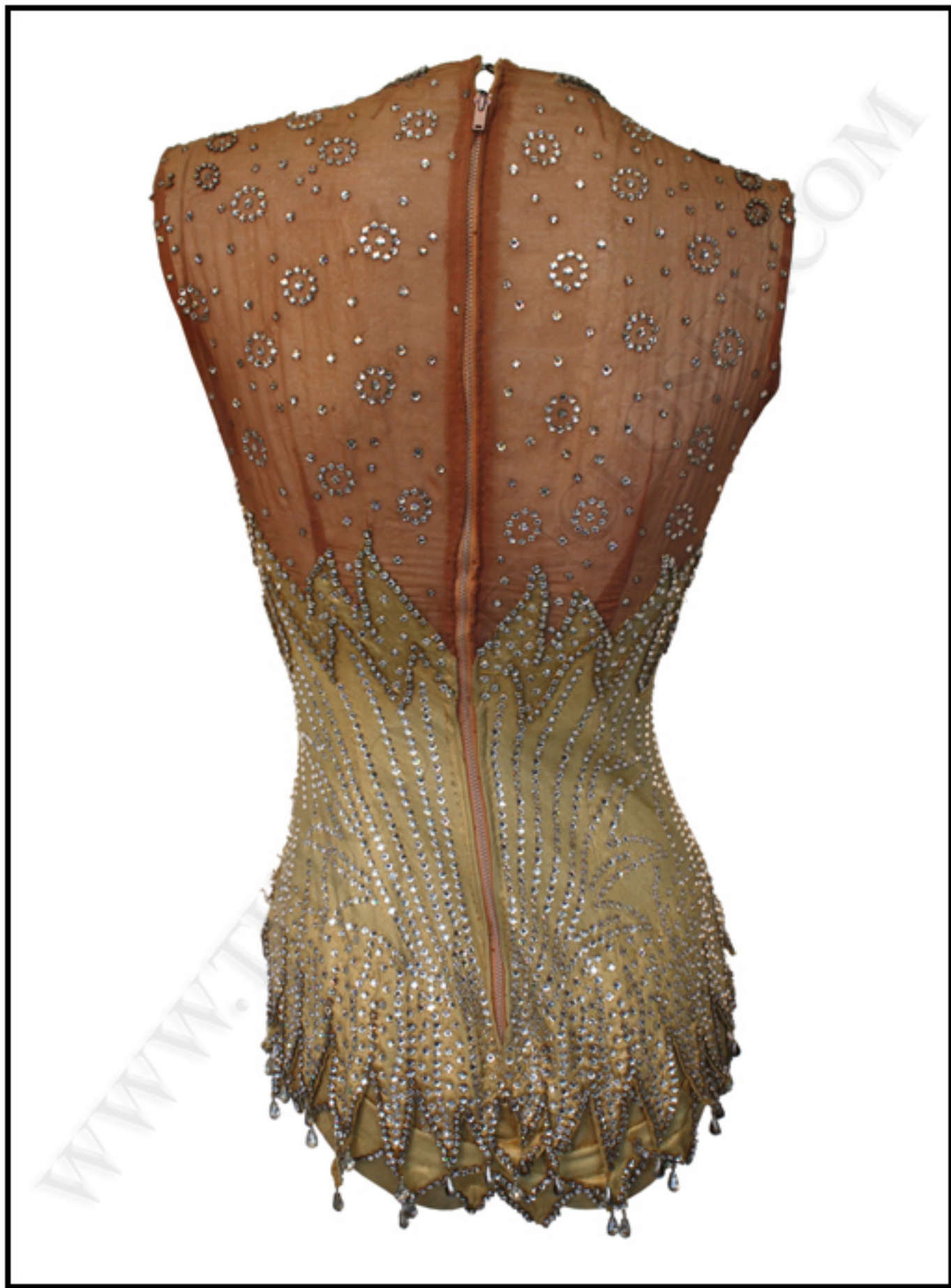
ARTICLE 1: BACK VIEW