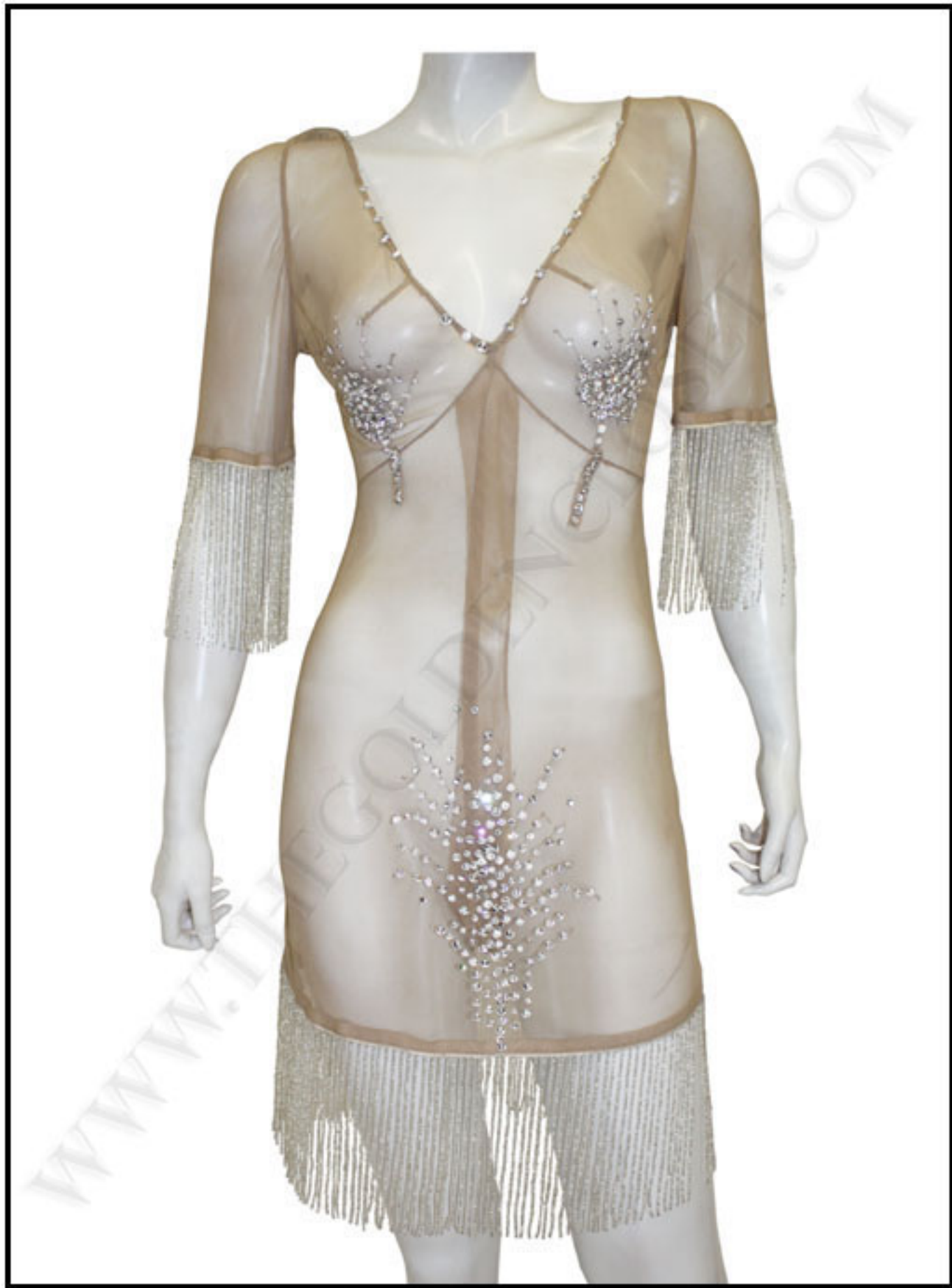
ARTICLE 3: FRONT VIEW