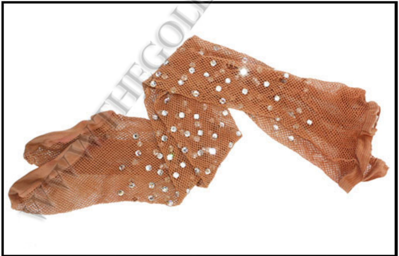
ARTICLE 4: TOP CLOSE-UP VIEW AND STOCKINGS