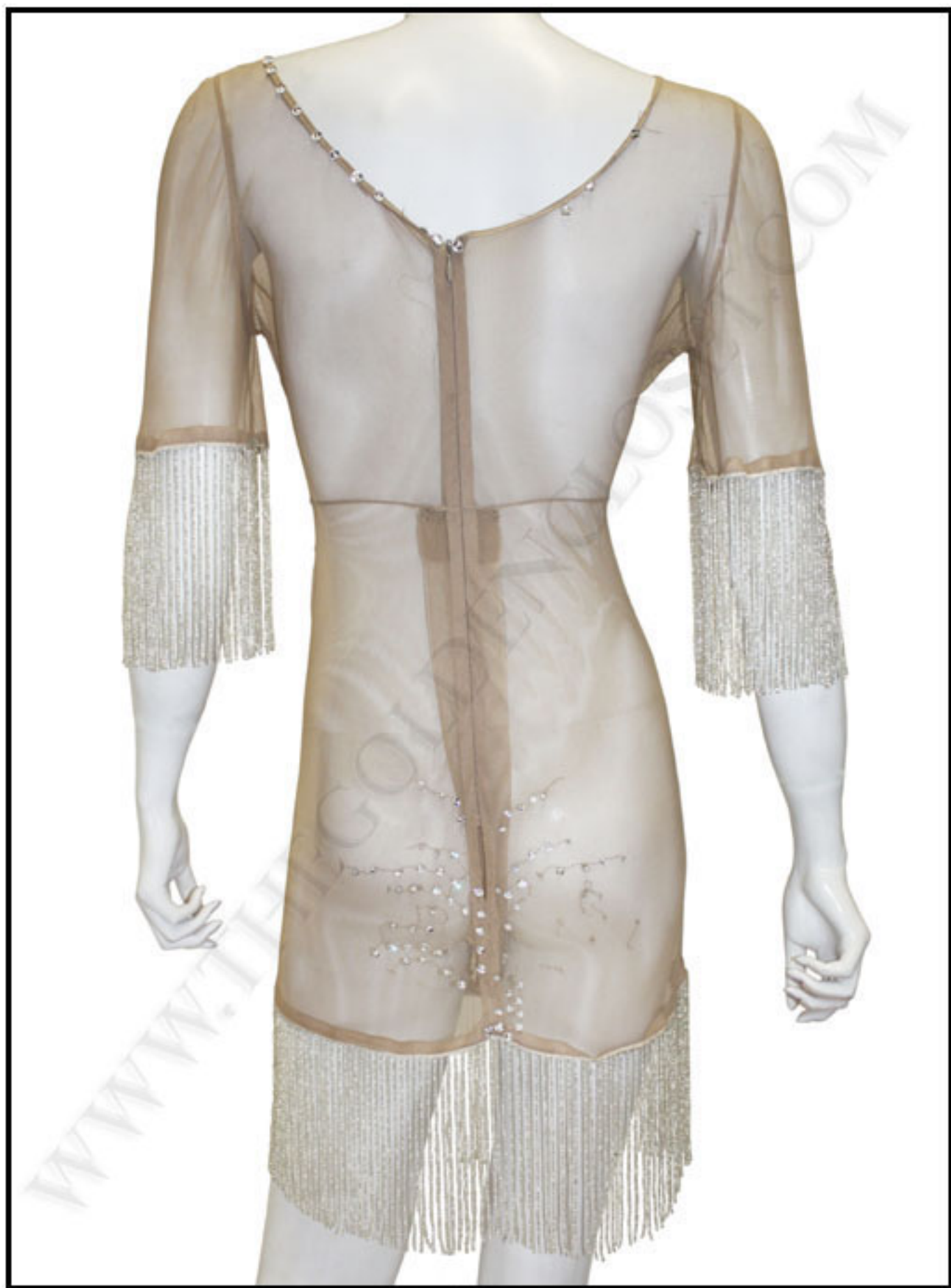
ARTICLE 3: BACK VIEW